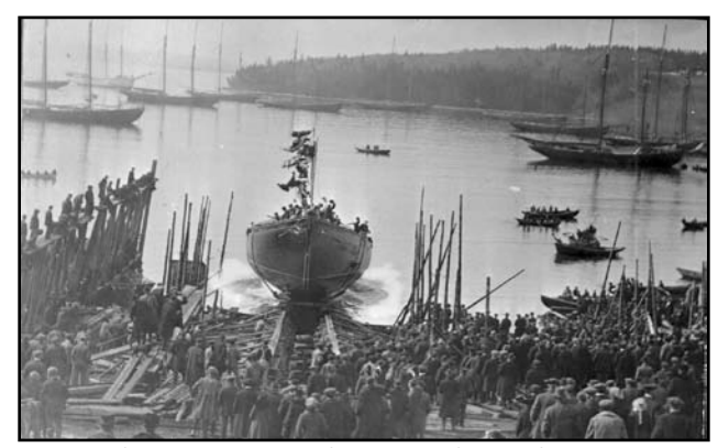
March 26, 1921. Bluenose hits the water.