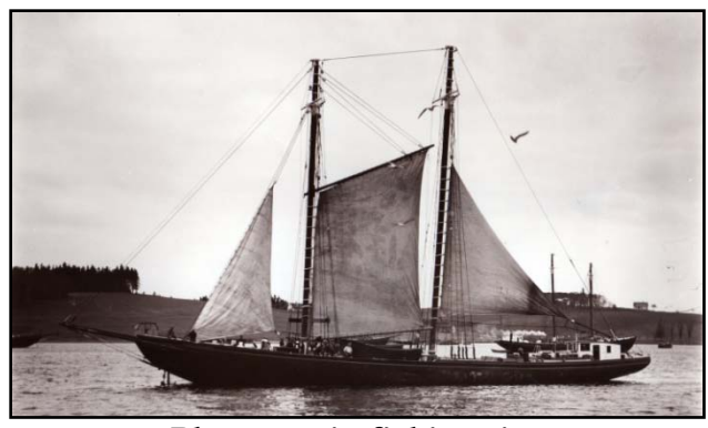
Bluenose, in fishing rig.